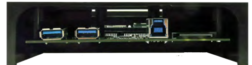
> USB Connection