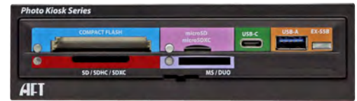
> Color Coded for easy card slot ID

Other certifications or licenses not shown can be done by customer requests Specifications are subject to change without further notice. All trademarks, trade names and copyrights are properties of their respective owners. Patents Pending in the U.S.A. and/or other countries USA: 6,705,878 ; 7,066,392 Germany : 202005004854.2 Japan: 20310488.9, 20078122, 20077940 Taiwan: 200520028275.2, 96213226, 96213227, China: 200720094655.5, 200720094654, 94201094